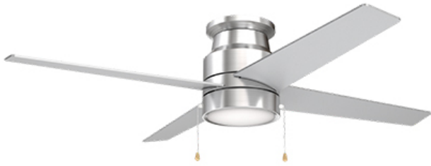
REVERSIBLE FAN BLADES